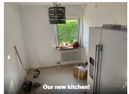
Our new kitchen!