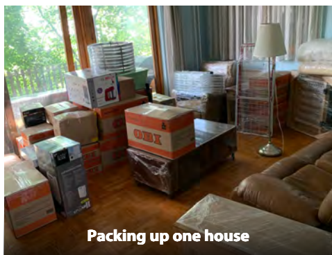
Packing up one house