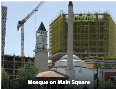
Mosque on Main Square