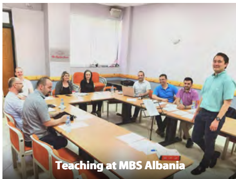
Teaching at MBS Albania

Discipleship Described: "Be imitators of me, just as I also am of Christ." 1 Corinthians 11:1